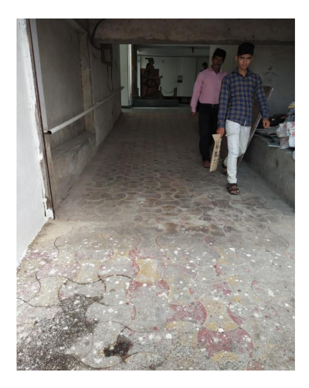
Students using Pedestrian Road