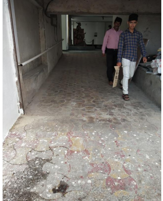
Students using Pedestrian Road