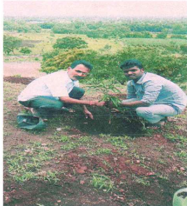
Photo during Digging of soil and Tree plantation made by staff