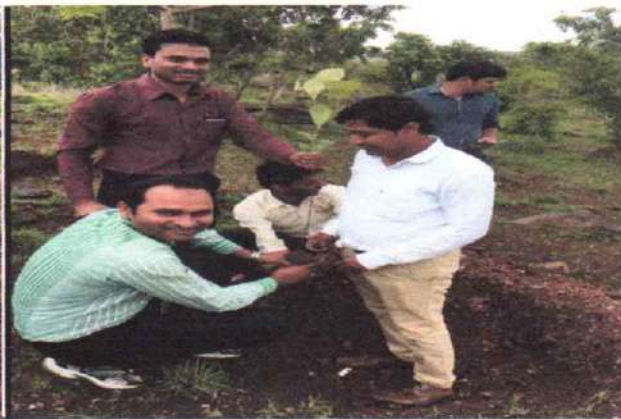
Staff During Tree Plantation