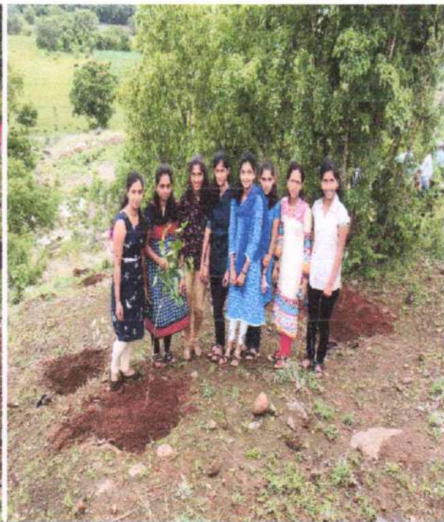
Tree plantation by ladies staff and Students