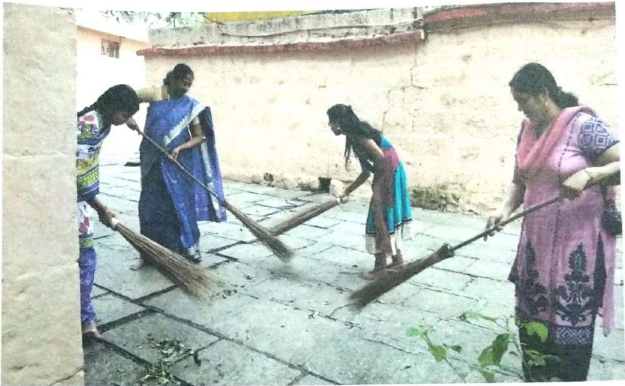
Staff and students are cleaning area near about Adbalsidhhanath Temple

have almost done cleaning of area behind college campus and area near about Adbalsidhhanath temple.