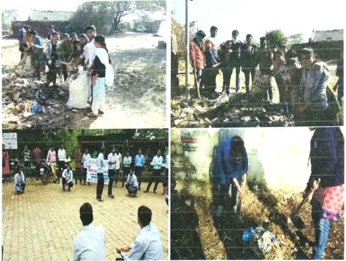
Photos During Swachha Bharat Abhiyan Campaign