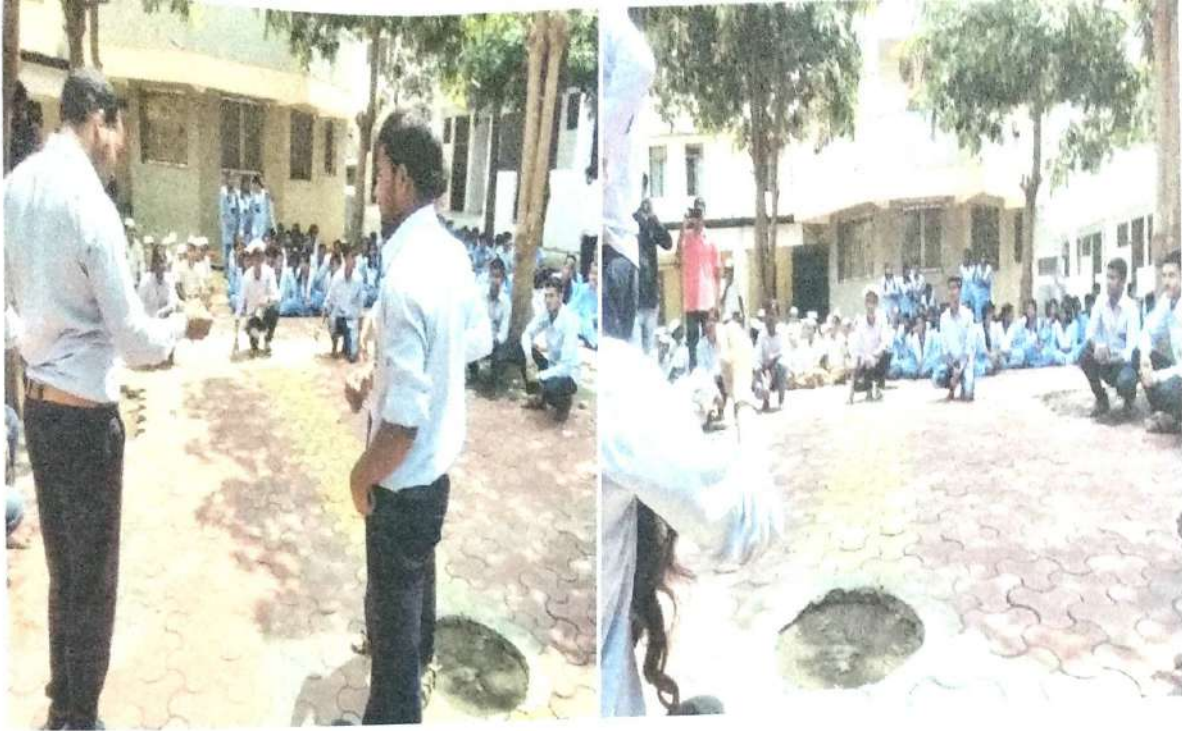
Students have performed street play at Khandala

On tenth & eleventh day we reached at Baneshwar, we cleaned area of Baneshwar Udyan where different reserves of different animals and birds are there. Baneshwar Udyan is one of the Tourist place of Maharashtra which is famous for Baneshwar Waterfall. On tenth and we cleaned area of Baneshwar Udyan. On eleventh we had played street play performance over there for Clean India Campaign to achieve mission of open-defecation free.