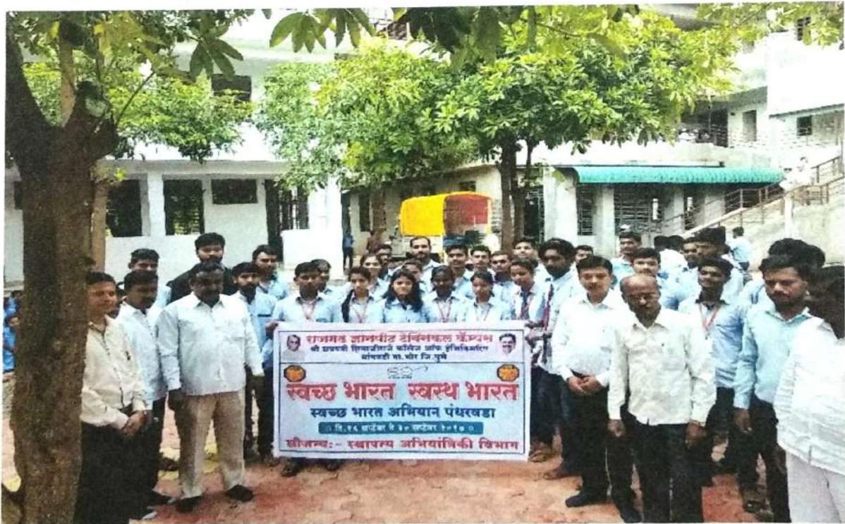
Staff and student giving slogans on Clean India to spread awareness regarding cleanliness

On Sixth and seventh day at Khandala students had played a street play performance on cleanliness in front of public mob. Main purpose of this street play to spread awareness regarding cleanliness eliminating open defecation through the construction of household-owned and community-owned toilets and establishing an accountable mechanism of monitoring toilet use.