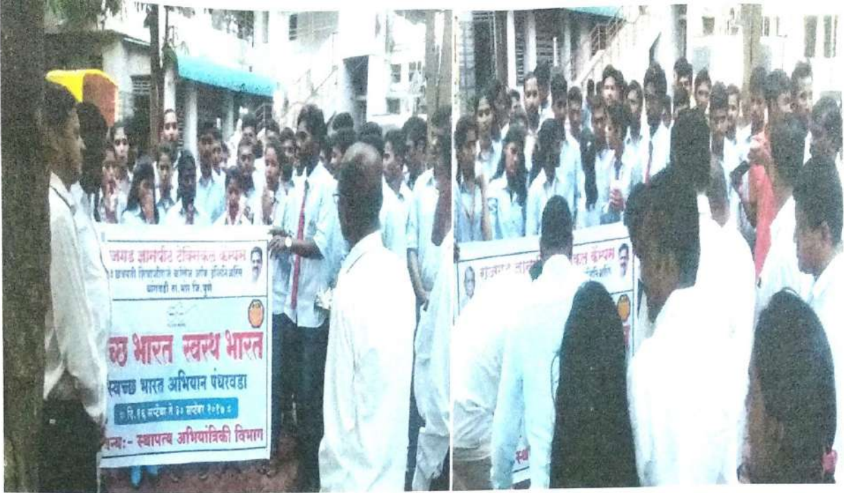
Students has given slogans on Clean India Campaign

On Sixth and seventh day at Khandala students had played a street play performance on cleanliness in front of public mob. Main purpose of this street play to spread awareness regarding cleanliness eliminating open defecation through the construction of household-owned and community-owned toilets and establishing an accountable mechanism of monitoring toilet use.