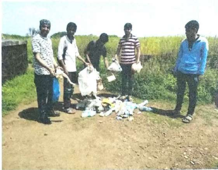
Clean India Campaign at RDTC'S SCSCOE, Dhangawadi

On sixteenth day 30/09/2018, our Principal has given a lecture on Clean India Campaign, He said that, "Sanitation is more important than Independence" India is still a developing country because of the poverty, lack of education, lack of cleanliness and other social issues. We need to eliminate all the bad reasons from the society causing obstruction in the growth and development of our country. Only the success of cleanliness campaign can bring a huge positive change in the India. It will support the internal and external growth and development of everyone living in India which shows us the completeness of slogan of "Clean, Happy and Healthy Citizens imparts Healthy and Developed Nation" .