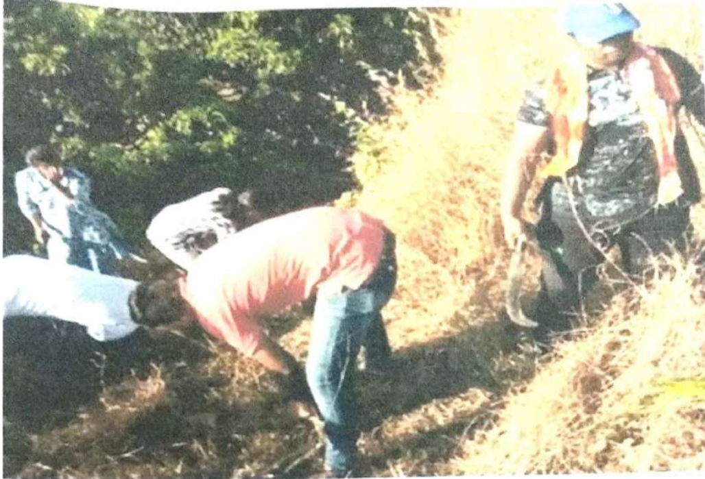
Student has collected waste material near Dhangawadi village

On Thirteenth day we reached at Balaji Temple at Ketkawali, where temple of god Krishna, it is also known as Prati Balaji temple. We reached Ketkawali at 11.00 AM. We started cleaning of area near about Ketkawali Temple.