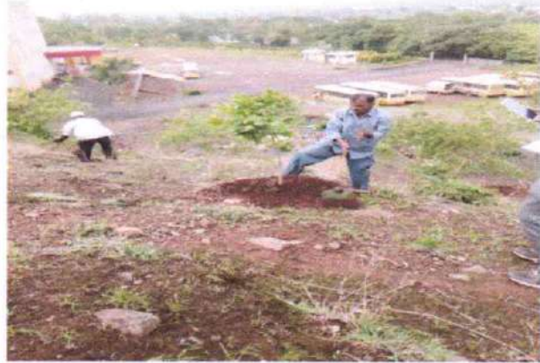
Tree plantation by Gents Staff