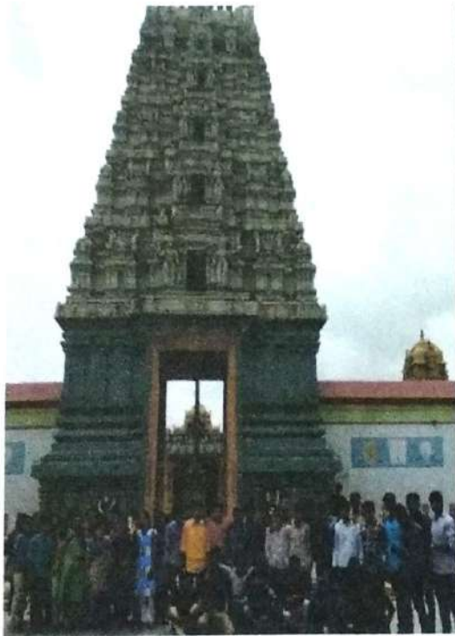
All staff & students gathered together at Balaji Temple

On Thirteenth day we reached at Balaji Temple at Ketkawali, where temple of god Krishna, it is also known as Prati Balaji temple. We reached Ketkawali at 11.00 AM. We started cleaning of area near about Ketkawali Temple.