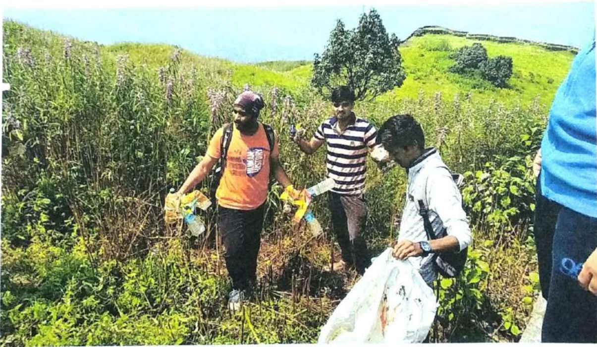
Collection of waste material at college campus area in bags

On second day we gathered together at 10.00 AM - 11.00 AM cleaned area on back side of Rajgad campus. After cleaning we plant a trees on backside of college campus near Hostel of RDTC, Dhangawadi.