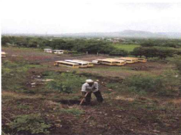
Non Teaching Staff During Digging.