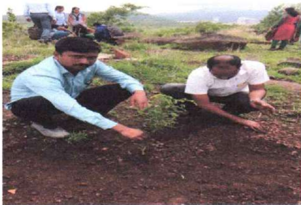
Staff and Students during Tree Plnatation