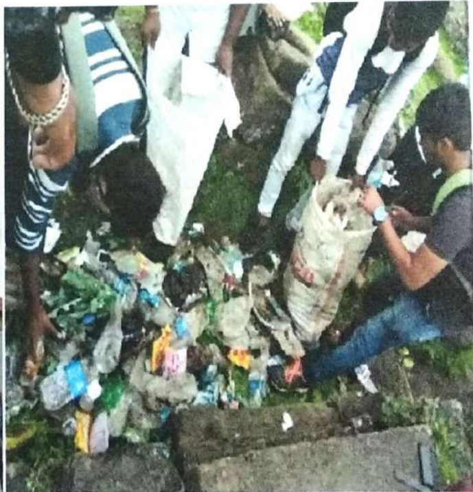
Collection of waste by students and staff at Ketkawale village

On fifteenth day 29/09/2017 at RDTC'S SCSCOE, Dhangawadi all staff and student gathered together to take pledge of Clean India, as "We will clean area near about my village daily, & I