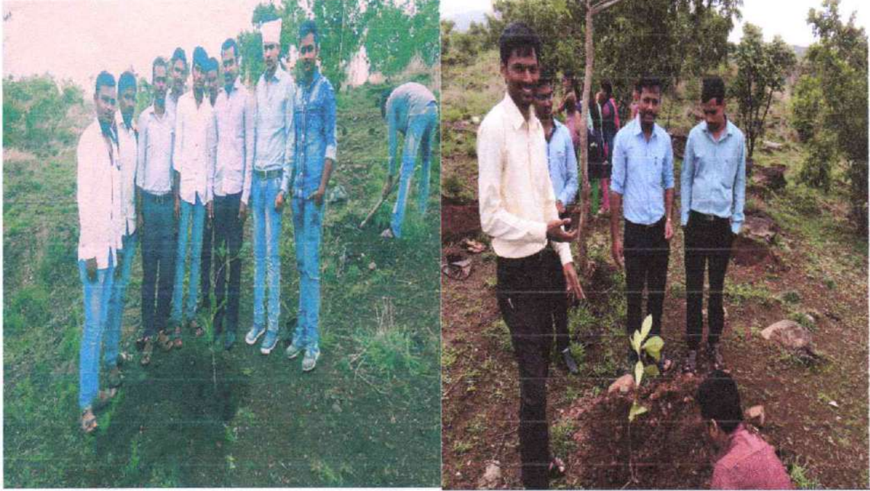
Tree Plantation made by Gents staff and students