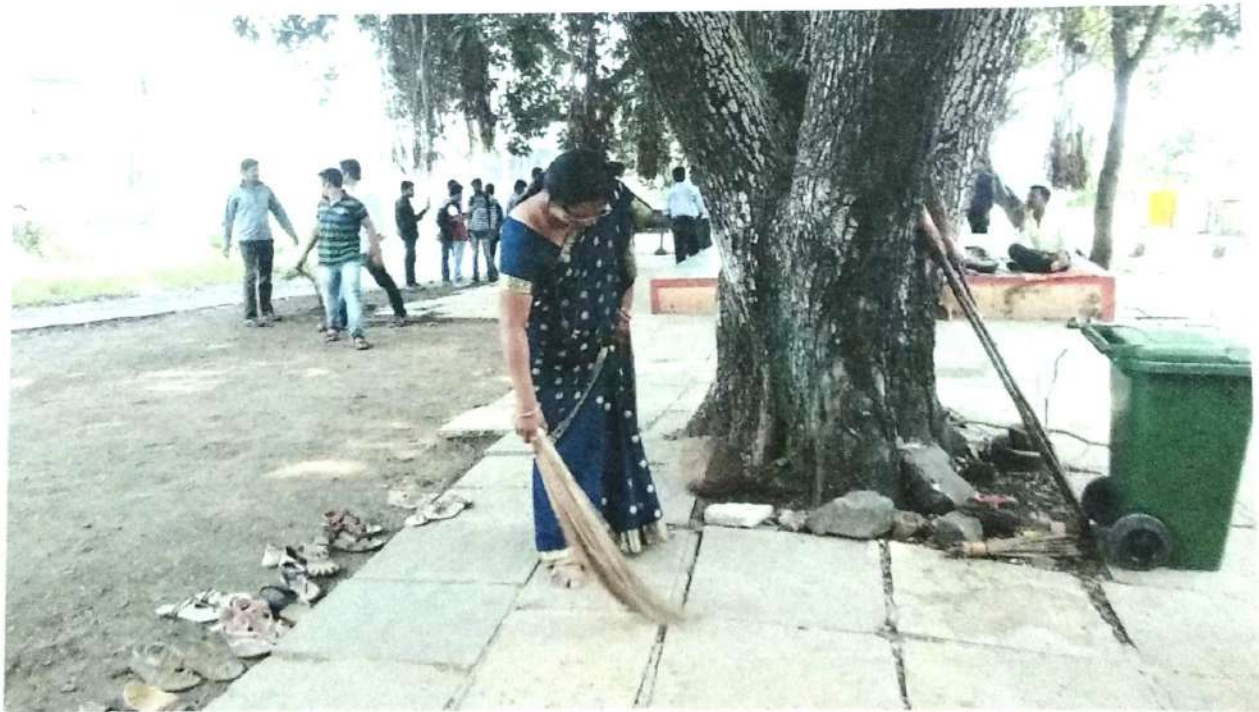
All faculties and student take a part in Clean India Campaign

On fifth day we reached at region of Khandala, student has made a rally which gives slogans on cleanliness and also cleans area near about bus stand of Khandala.