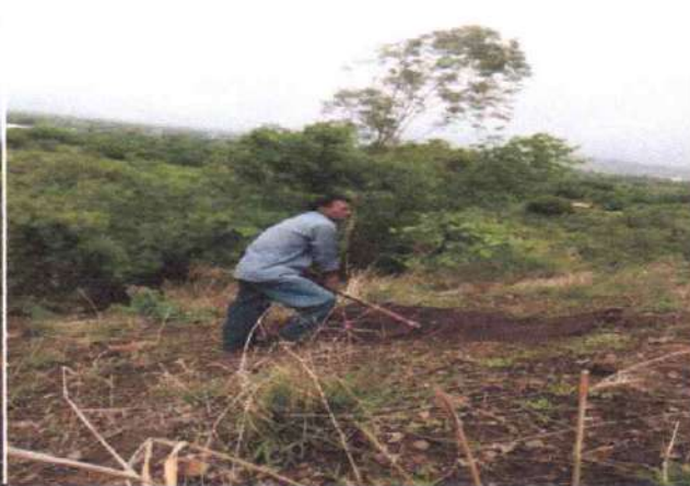
Non Teaching Staff During Digging