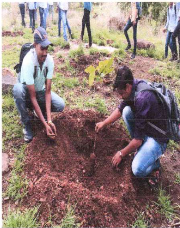
Photo during Tree Plantation by ladies staff and students