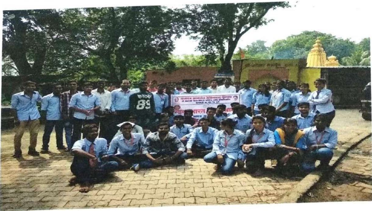
Student and staff gathered together at Baneshwar in the Morning

On tenth & eleventh day we reached at Baneshwar, we cleaned area of Baneshwar Udyan where different reserves of different animals and birds are there. Baneshwar Udyan is one of the Tourist place of Maharashtra which is famous for Baneshwar Waterfall. On tenth and we cleaned area of Baneshwar Udyan. On eleventh we had played street play performance over there for Clean India Campaign to achieve mission of open-defecation free.