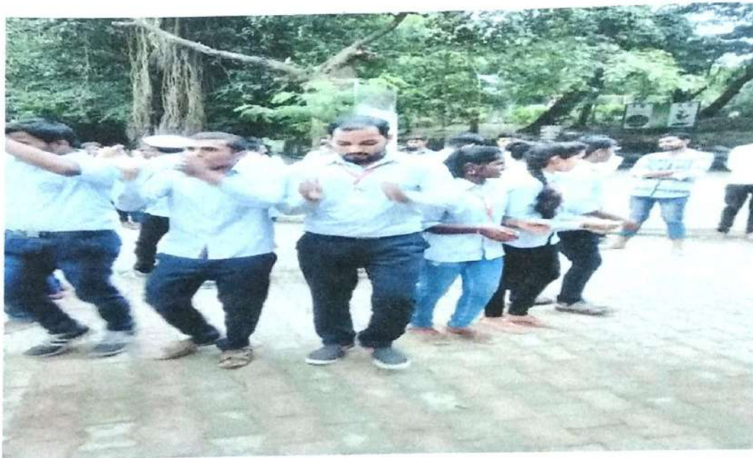
Student had played street play performance at Baneshwar

On twelveth day we reached Dhangawadi village at 10.30 AM main purpose of spread awareness regarding Clean India Campaign for open defecation free India. Also gives importance of plantation of trees.