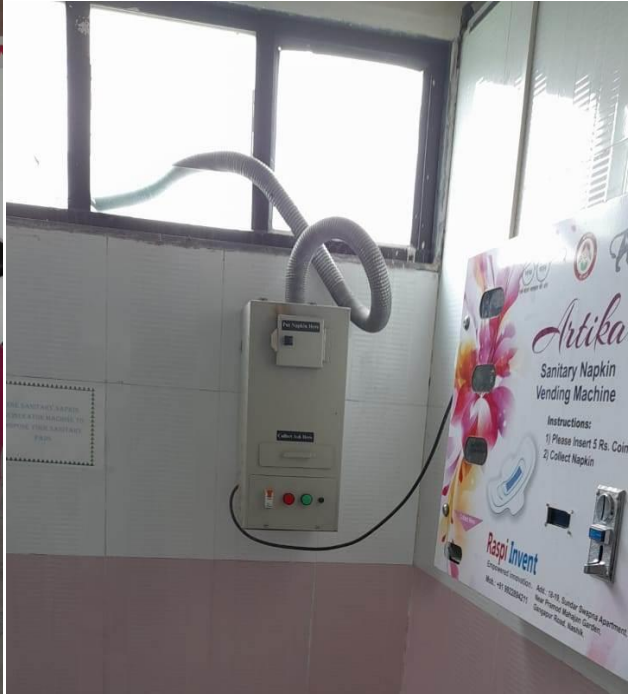
Facilities of Common Room