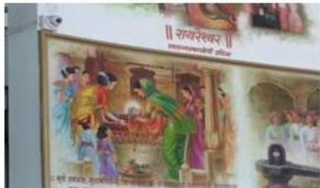
CCTV in main Entry Passage