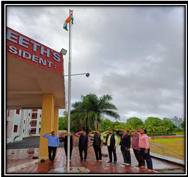
A) Republic Day