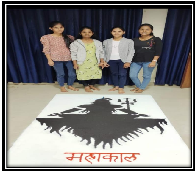
G) Rangoli Competition