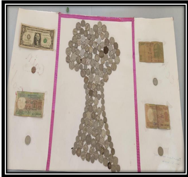
I) Coin Collection Competition