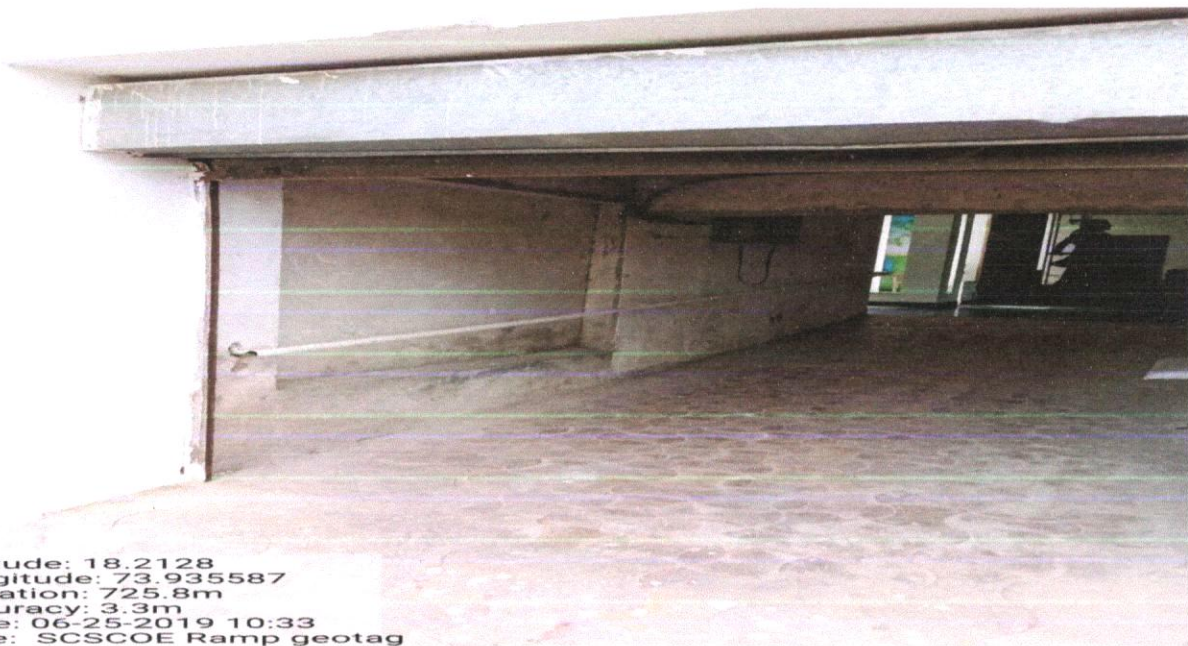
Availability of Ramp near workshop Building

Latitude: 18.2128 Longitude: 73.935587 Elevation: 725.8m Accuracy: 3.3m Time: 06-25-2019 10:33 Note: SCSCOE Ramp geotag