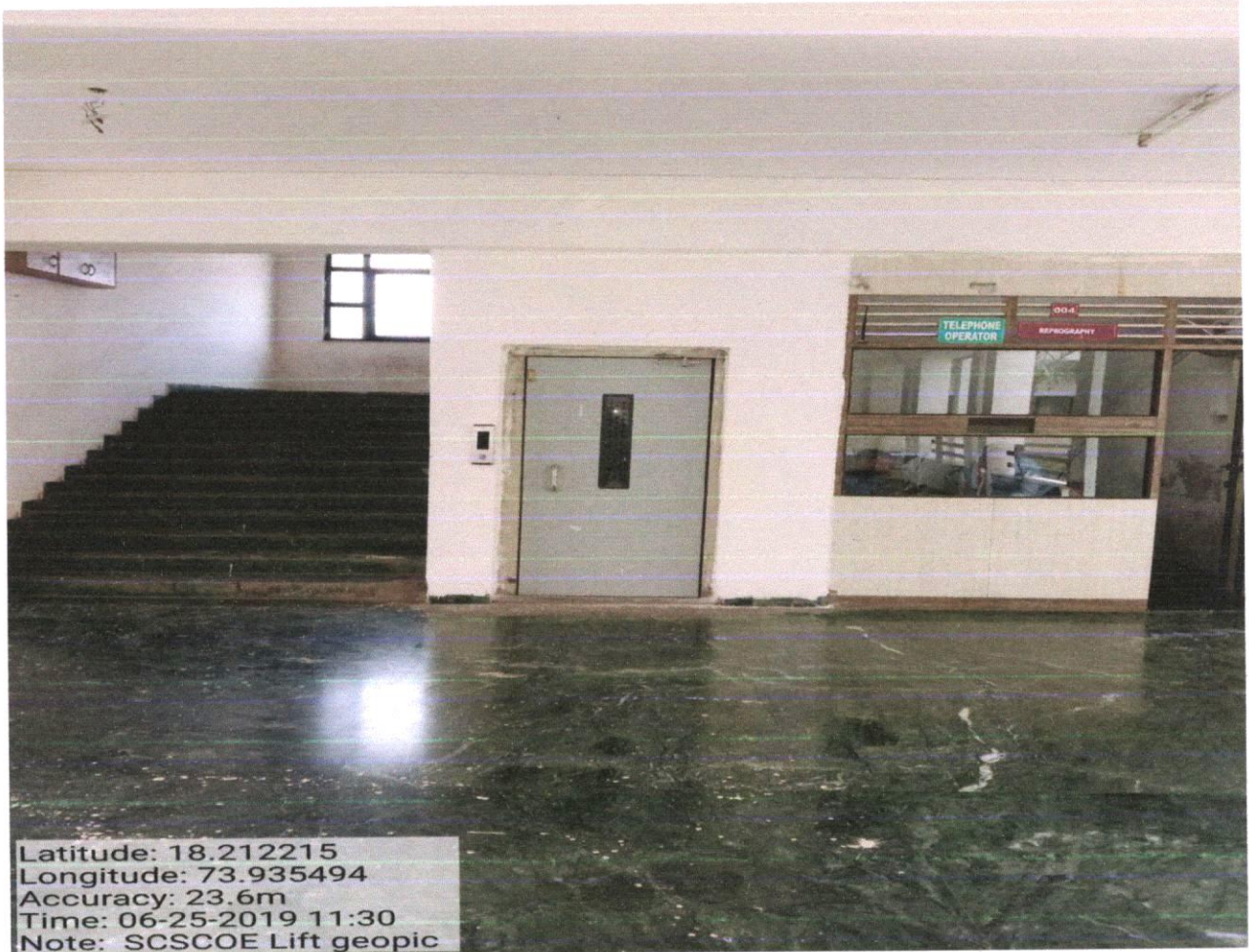
Lift for differently abled (Divyangjan) in main building