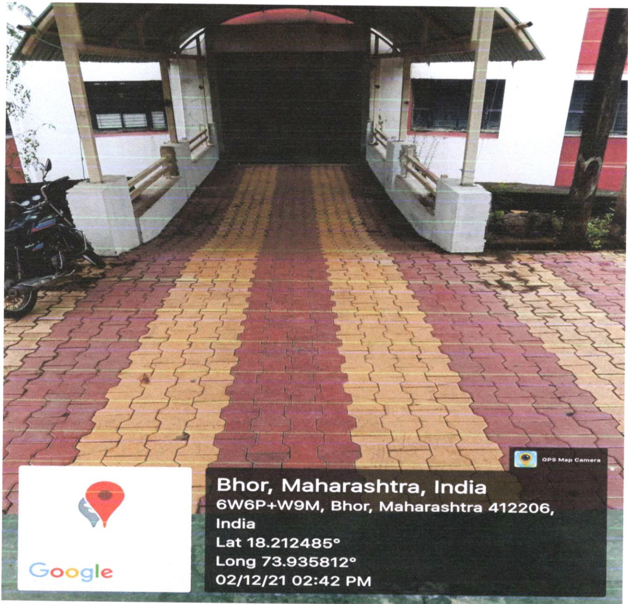
Availability of Ramp near workshop Building

Our Institute has two ramps which are provided in the main academic building. One is near the Entrance of the main building and another one is near the workshop building. Physically handicapped students/staff can make use of it.