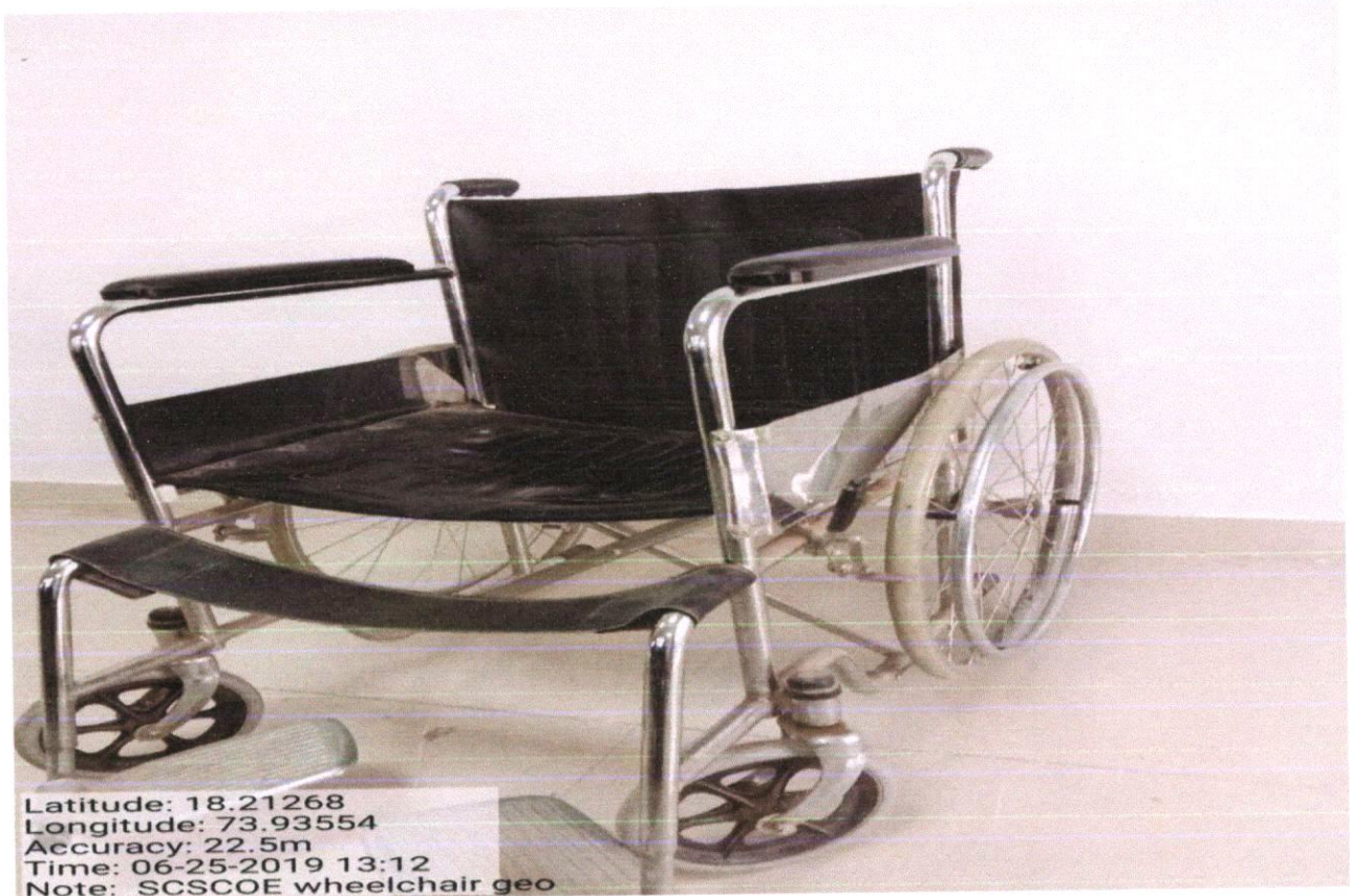
Wheelchair for differently abled (Divyangjan) in main building

Our institute has an availability of wheel chair for differently abled peoples in order to smoothly move from one place to another place in the campus.