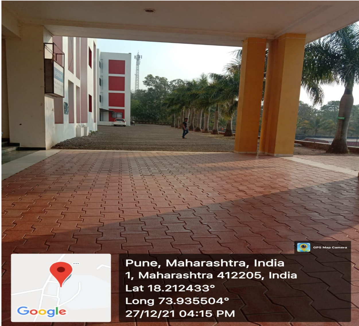
Pedestrian Path in the campus

The institute has pedestrian friendly pathways. The college campus is made accessible with pathways which are used by all students and staffs.