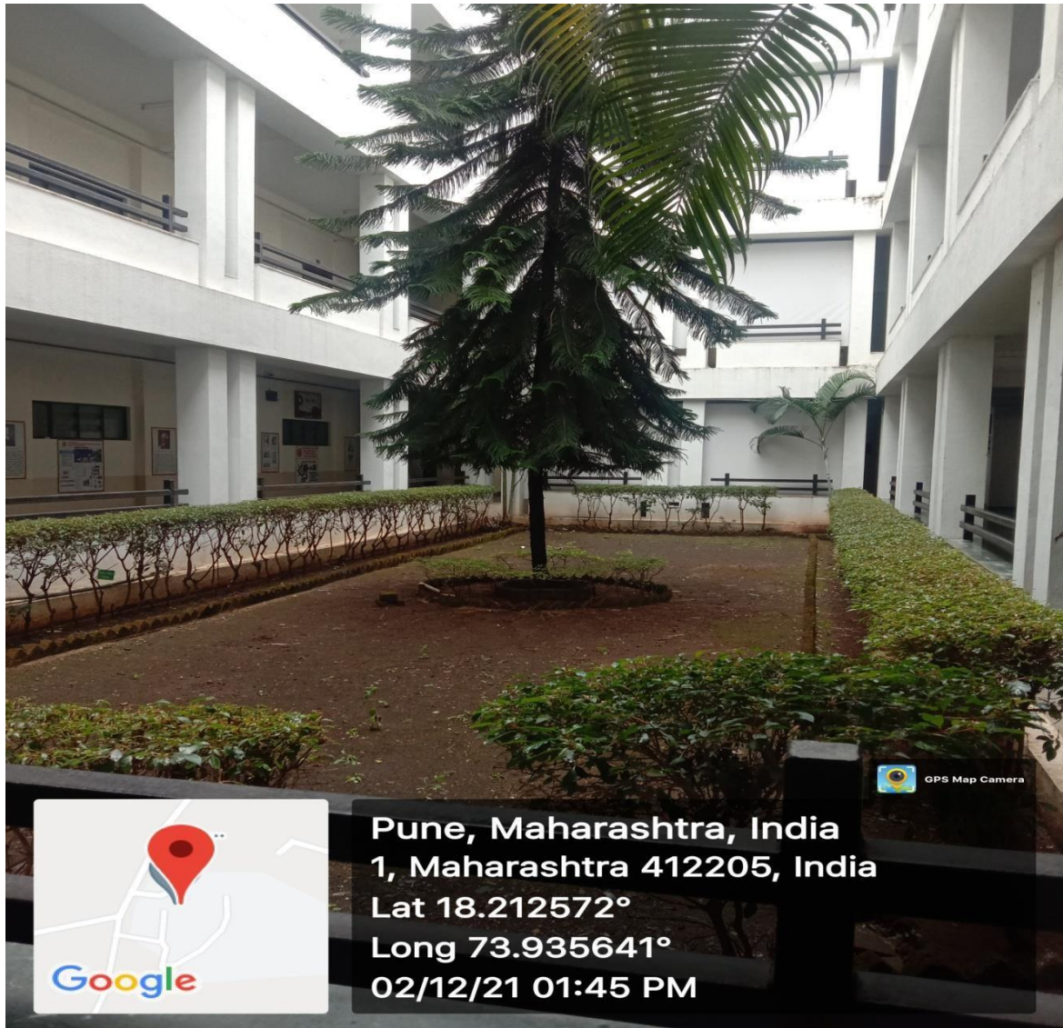
Landscaping with trees and plants