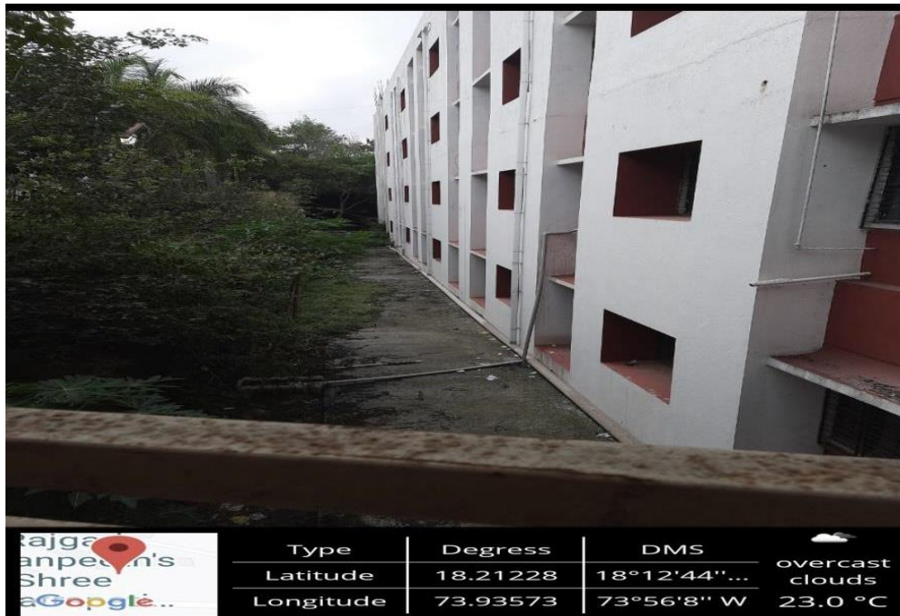
Rain water harvesting system

Rain water harvesting system is adopted in the institute for water conservation. The pipes are laid down to collect rain water from the roof top of the institute building. The collected water is disposed in the ground to increase the ground water table. The ground water is pumped out through bore well and utilized for landscaping and gardening. The sprinkler irrigation system is used for watering garden and landscaped area.