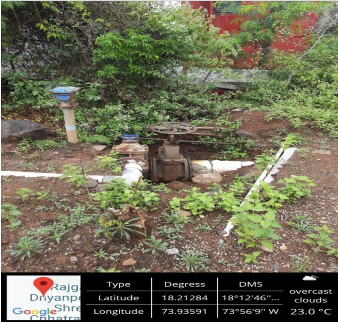
Inlet valve of water supply system

The college is getting water as per their requirement from Rajgad No.1 Co-operative water supply society Ltd. Anantnagar. The water is stored in a tank and then distributed to the all buildings.