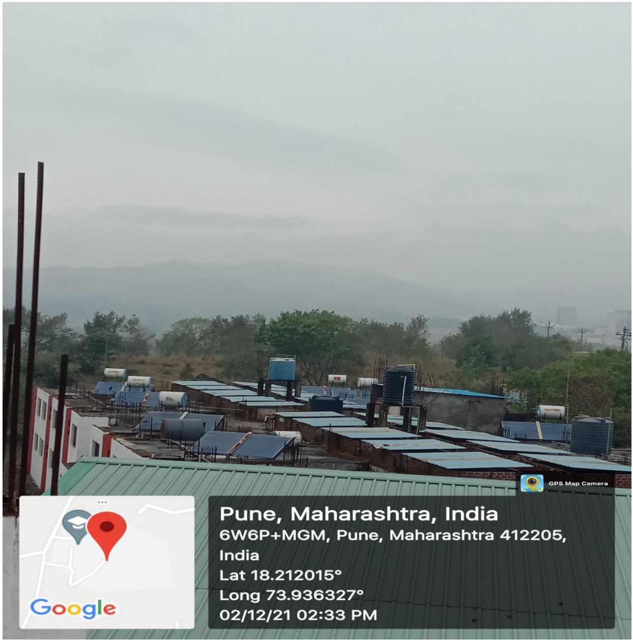
Solar Thermal Hot water System Geo tagged Photograph