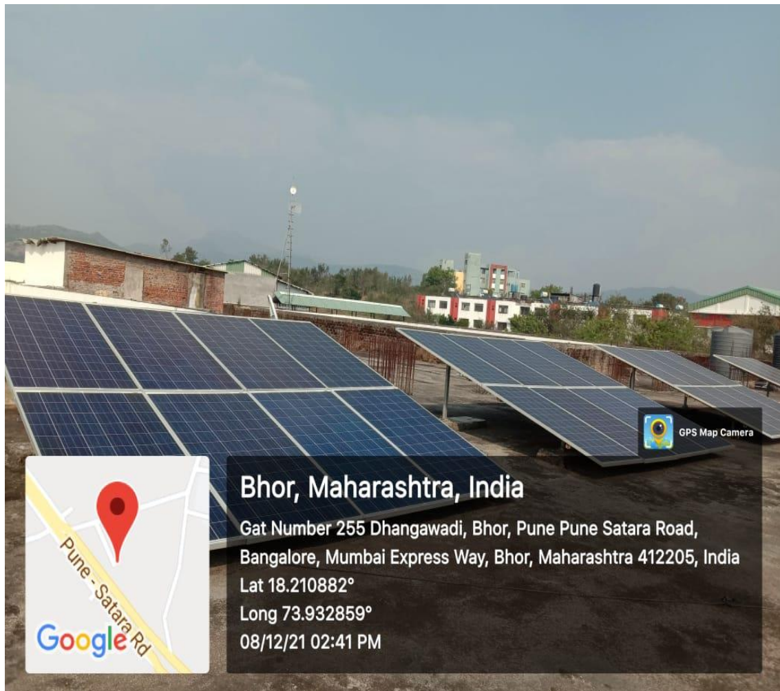
Solar Energy Geo tagged Photograph

Institute has installed Roof top Solar PV Plant of Capacity 10 kWp. For Hostel blocks, the Solar Thermal Hot water System is used. The capacity is 10000 LPD.